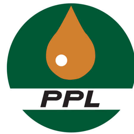
Pakistan Petroleum Limited